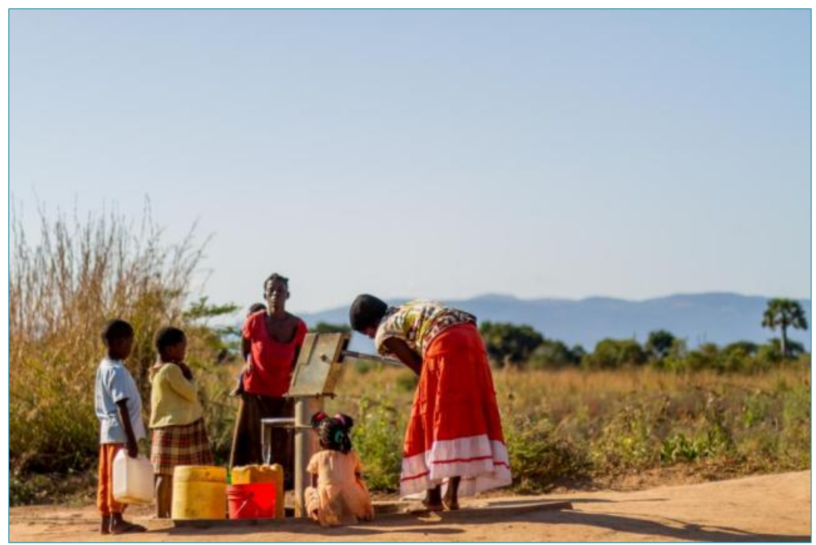
Villagers from Muleka Chiefdom draw water from Irish Aid funded Borehole Irish Aid, 2013